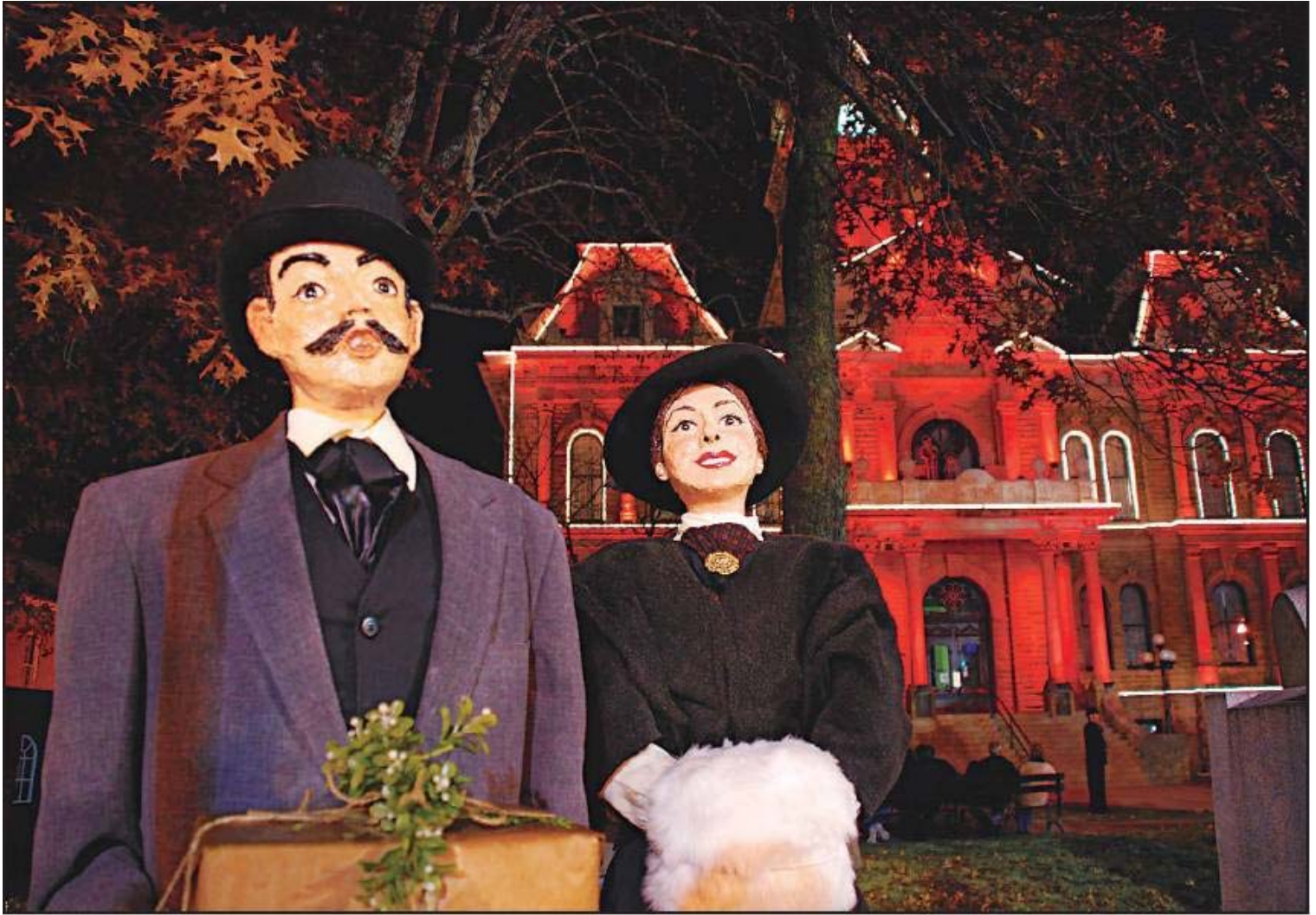
GUERNSEY COUNTY VISITORS & CONVENTION BUREAU

From late November to early January, the Guernsey County Courthouse light show is presented every evening starting at 6 p.m.