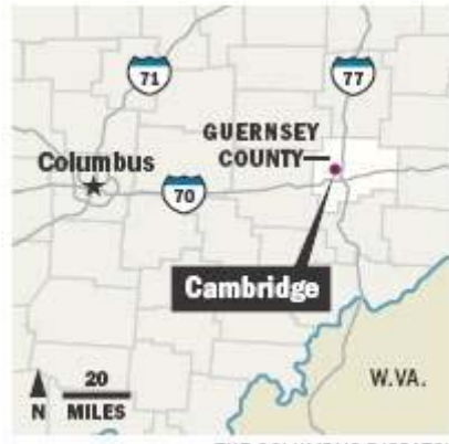
THE COLUMBUS DISPATCH